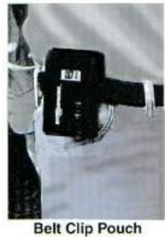
Belt Clip Pouch

The following shows all the features & specifications of the A-21ZX